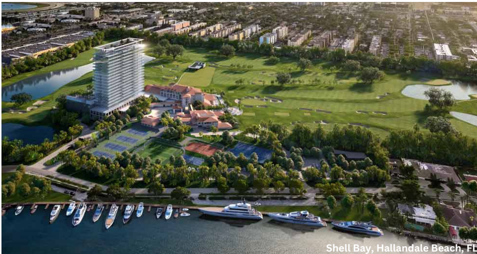
Shell Bay, Hallandale Beach, FL