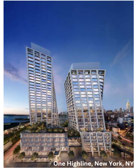
One Highline, New York, NY