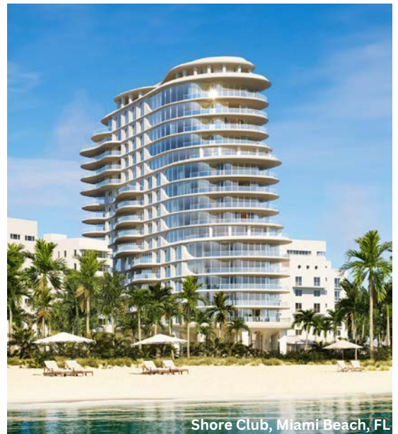
Shore Club, Miami Beach, FL

A NEW ERA IN LUXURY PROPERTIES AND FORWARD THINKING DEVELOPMENT