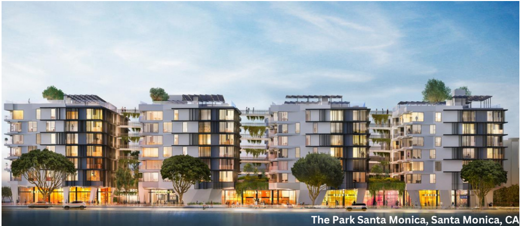
The Park Santa Monica, Santa Monica, CA