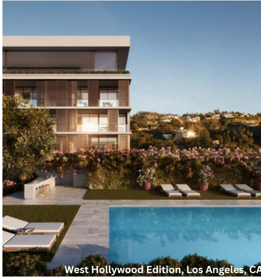
West Hollywood Edition, Los Angeles, CA