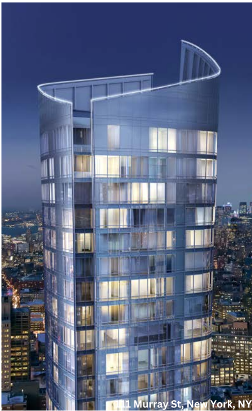
11 Murray St, New York, NY