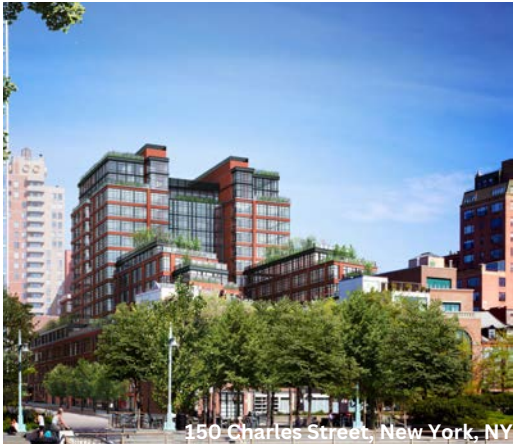
150 Charles Street, New York, NY