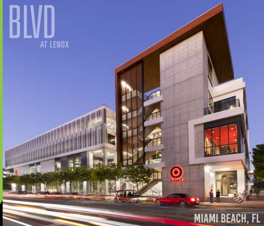
MIAMI BEACH, FL

The driving force behind the transformation of South Florida's most desirable mixed-use districts over the past 30 years.