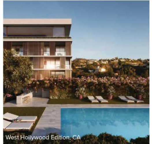
West Hollywood Edition, CA