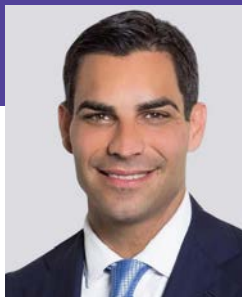
FRANCIS X. SUAREZ Mayor, City of Miami

Francis X. Suarez is the 33rd Mayor of Miami. As the first Miami-born mayor, he is committed to building a Miami that lasts forever and that welcomes everyone. Elected with an electoral mandate of 86 percent, Mayor Suarez has championed the integration of climate adaptive technologies, building practices, and economic policies across all facets of government as part of his Miami Forever Plan.