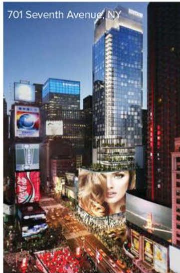
701 Seventh Avenue, NY