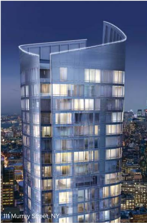
111 Murray Street, NY

NEW YORK | MIAMI | LOS ANGELES | LAS VEGAS