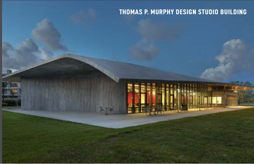
THOMAS P. MURPHY DESIGN STUDIO BUILDING

MORE INFO: MREDU.ARC.MIAMI.EDU MREDU@MIAMI.EDU | 305.284.4420 TWITTER: @UM_SOA | @UMIAMIMREDU