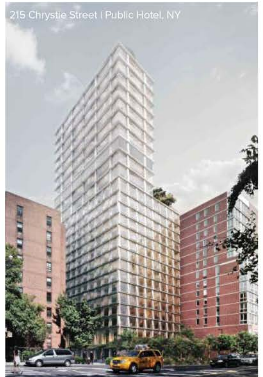
215 Chrystie Street | Public Hotel, NY

A NEW ERA IN LUXURY PROPERTIES AND FORWARD THINKING DEVELOPMENT