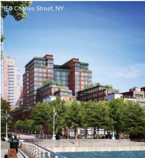
150 Charles Street, NY