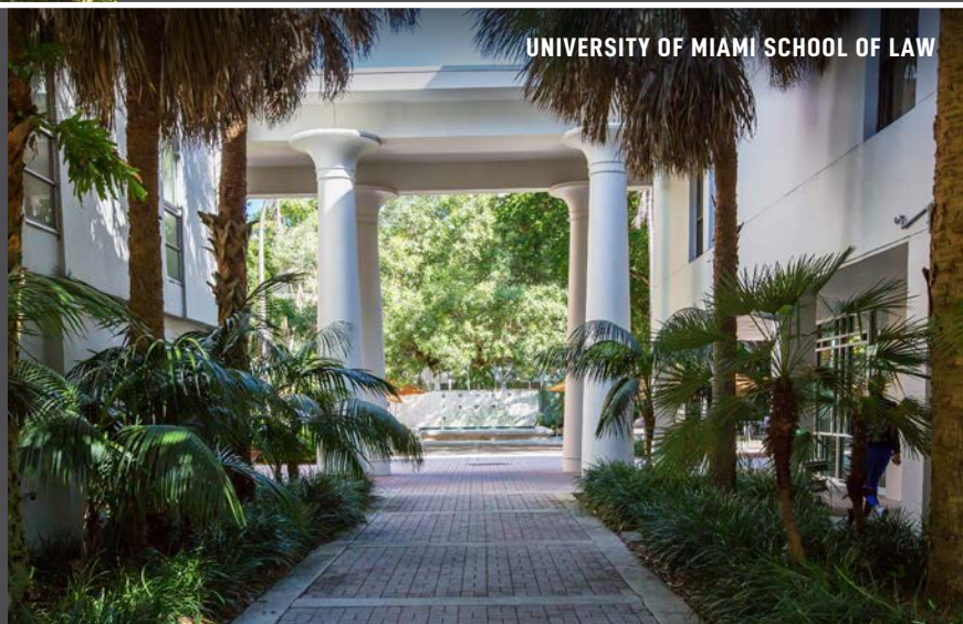
UNIVERSITY OF MIAMI SCHOOL OF LAW

MORE INFO: LAW.MIAMI.EDU RPDINFO@LAW.MIAMI.EDU | 305.284.1754 TWITTER: @MIAMILAWSCHOOL | @RPDPGRAM_UM