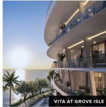
VITA AT GROVE ISLE