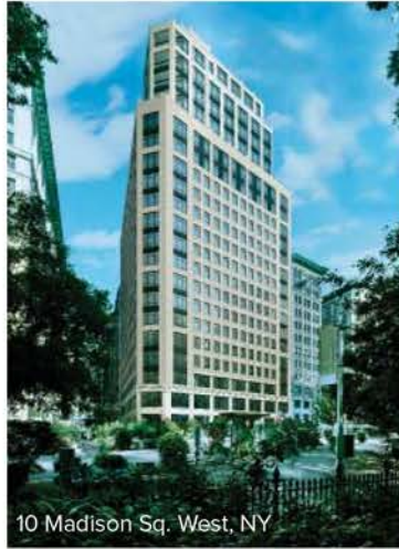
10 Madison Sq. West, NY